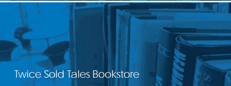
Twice Sold Tales Bookstore