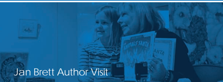
Jan Brett Author Visit