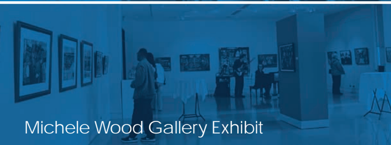
Michele Wood Gallery Exhibit